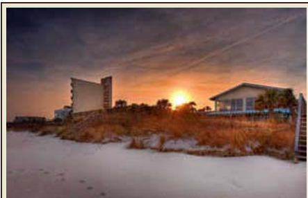
Holger M. E. Obenaus

The Oceanfront Litchfield Inn is located at 1 Norris Drive, Pawleys Island. For reservations, call 1-800-637-4211 or visit www.litchfieldinn.com .